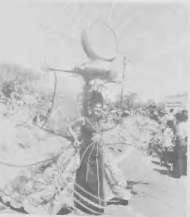
Nightfall on Jupiter